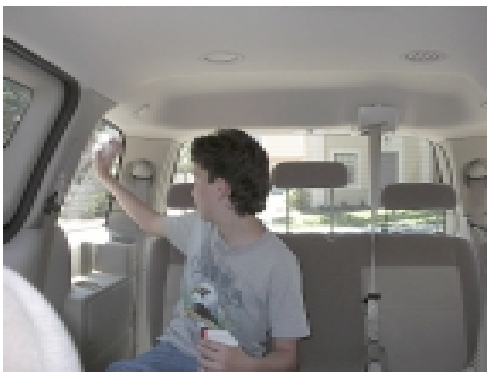
Entry-level jobs in the service sector are currently plentiful