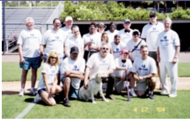
Several players from both teams get together after the game to pose for a group photo

Beepball is a modified form of softball that enables blind or blindfolded players to play the game by sound versus sight. The ball is equipped with a special beeper and the bases are tall sponge-rubber columns that contain loud