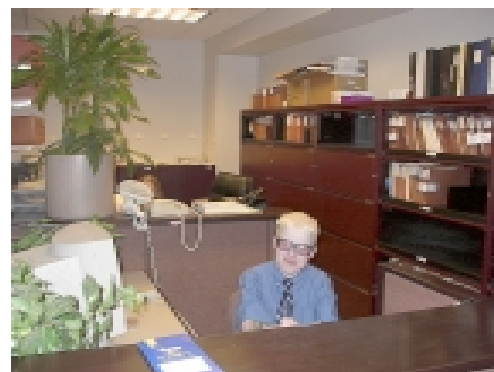
Good clerical jobs are also a popular choice