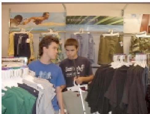
Dressing for success is important for landing that highly sought-after job