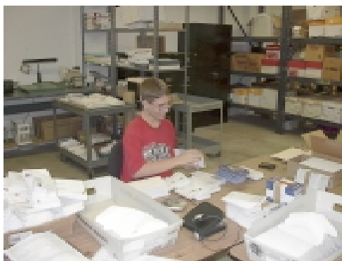
Many jobs start in the mailroom

funded by the Division of Blind Service; and carried out by the Lighthouse in partnership with the Vision Programs of Hillsborough and Polk County School Systems. The program ran in parallel in both our Tampa and Winter Haven facilities. However, it was not all work and no play as the teens were all treated to a trip to Disney World at the end of the program.