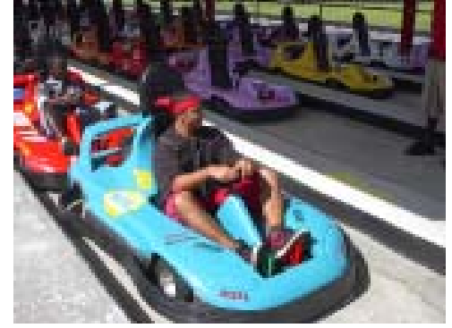
Time was set aside for some fun activities such as carting on a guided track

and carried out by the Lighthouse in partnership with the Vision Programs of Hillsborough and Polk County School Systems. Thanks also go out to our job placement team for arranging the work experiences.