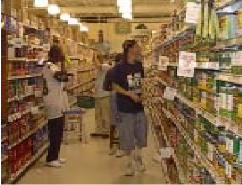
Trip to grocery store provides lesson in shopping smart

Our Third Annual Summer Transition Program provided our teen participants, all of whom are blind or visually impaired, with 5 weeks of highly substantive learning experiences to prepare them for the real world of work. This included many learning opportunities to gain both knowledge and hands-on work experiences in the community. Examples of activities include mock and actual job interviews; training in organizational skills, do's and don'ts of the workplace, personal hygiene, assistive technology, appropriate business attire, and other daily living skills. Programs ran simultaneously in our Tampa and Winter Haven facilities where we had 15 students in our Tampa program and 9 students in our Winter Haven program. Several field trips were conducted to allow the students to practice the skills learned at the facility included shopping trips, dining in local restaurants, bus trips, and visits