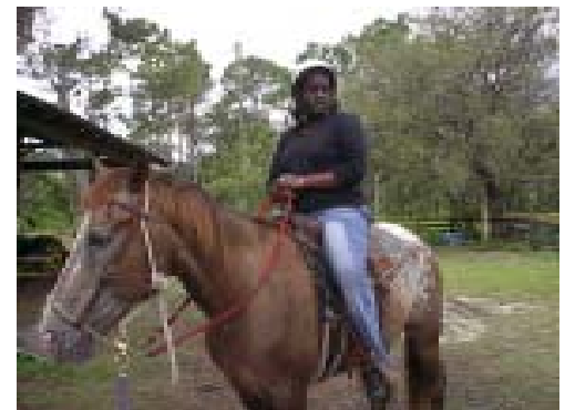
Horseback riding was among the other fun activities

and carried out by the Lighthouse in partnership with the Vision Programs of Hillsborough and Polk County School Systems. Thanks also go out to our job placement team for arranging the work experiences.