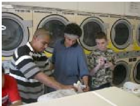
Trip to laundromat to teach clothing care

This program was initiated and funded by the Division of Blind Service;