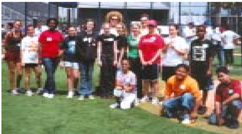
Most of the young volunteers shown above are from the First Reformed Church Amaranth Youth Group. Two who joined in are children of volunteering Bausch & Lomb employees. They assisted the fielders and escorted the blind and blindfolded players to and from their respective fielding and batting positions