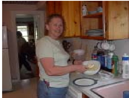
She also prepares meals for her patients based on their dietary requirements