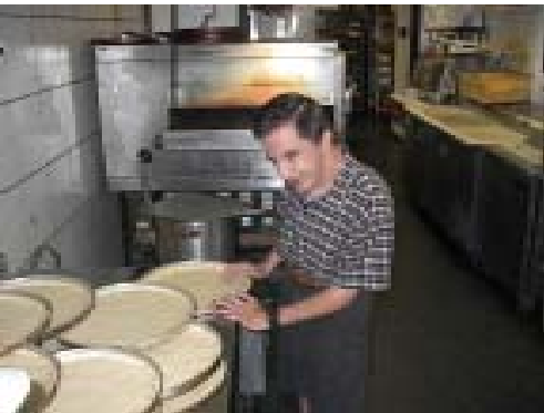
Work experience in a pizza restaurant

Our Third Annual Summer Transition Program provided our teen participants, all of whom are blind or visually impaired, with 5 weeks of highly substantive learning experiences to prepare them for the real world of work. This included many learning opportunities to gain both knowledge and hands-on work experiences in the community. Examples of activities include mock and actual job interviews; training in organizational skills, do's and don'ts of the workplace, personal hygiene, assistive technology, appropriate business attire, and other daily living skills. Programs ran simultaneously in our Tampa and Winter Haven facilities where we had 15 students in our Tampa program and 9 students in our Winter Haven program. Several field trips were conducted to allow the students to practice the skills learned at the facility included shopping trips, dining in local restaurants, bus trips, and visits