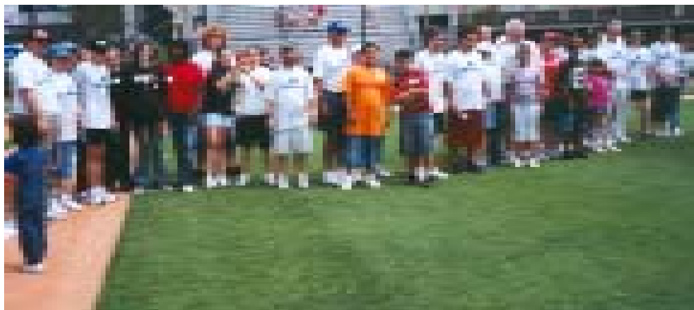
Players for both teams and the volunteers from the First Reformed Church Amaranth Youth Group and Bausch & Lomb line up together.