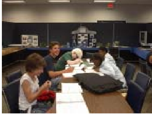
Classroom instruction was provided in job seeking skills

to the bank to cash their work experience paychecks.