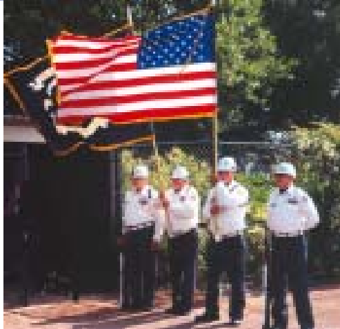
The Military Order of the Purple Heart Color Guard conducted the pre-game color guard ceremony.