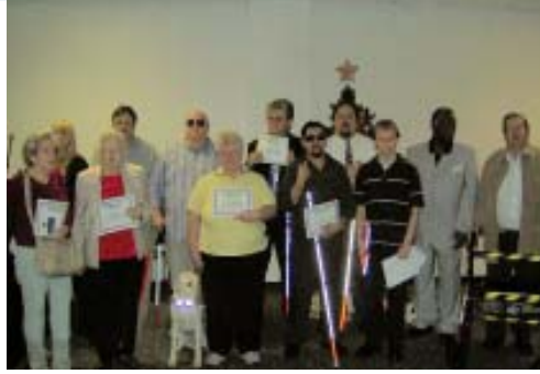
Winter Haven's Class of 2009.