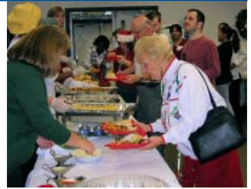
Lunch consisted of chicken, pasta, rolls, salad, iced tea, and graduation cake.