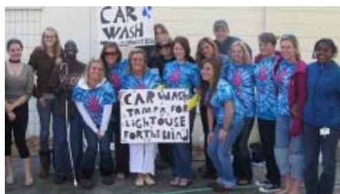
Delta Gamma members put on a car wash to benefit the Lighthouse's Transition Program.