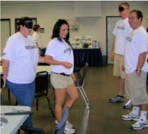
The volunteers learned the sighted guide technique by taking turns wearing blindfolds and guiding each other.

This year's United Way-sponsored Day of Caring was a fall celebration with a good ol' fashioned lunchtime cookout for our clients, past and present. We were fortunate enough to have two groups adopt us: Traveler's Insurance—their 2 nd year helping us out, and Enterprise Leasing (new) giving us a total of 21 volunteers. Before the preparations began, the volunteers were treated to a hands-on orientation that included an agency tour complete with computer Tampa Lighthouse For The Blind