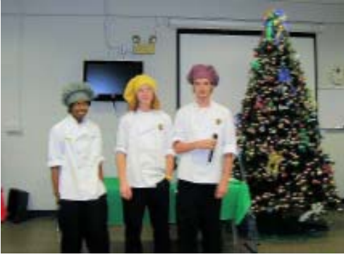
These chefs-in-training from Wharton High School's culinary arts program prepared, delivered, and served lunch.