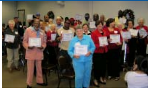
Tampa's Class of 2009.

A party following the graduation ceremonies at both locations featured a complete lunch, graduation cake for dessert and bags of goodies to take home. In Tampa, a culinary class at Wharton High School prepared the