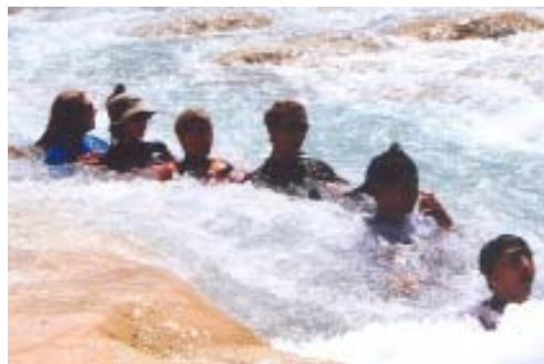
Students learned recovery techniques to use in case their rafts capsize in the turbulent rapids.