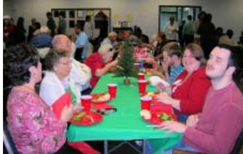
Many turned out to enjoy the festivities.