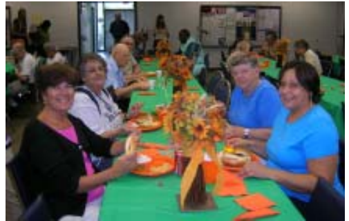
Current and former Lighthouse clients were all invited to a good ol' fashioned fall picnic of hamburgers, hotdogs, potato salad, chips, and home-made ice cream.

The turnout was quite good and the weather cooperated. It was a wonderful time for many to see old friends not seen in a long time and for the staff to get caught up on how our past participants have progressed since their last involvement in the various Lighthouse programs. The volunteers had a great