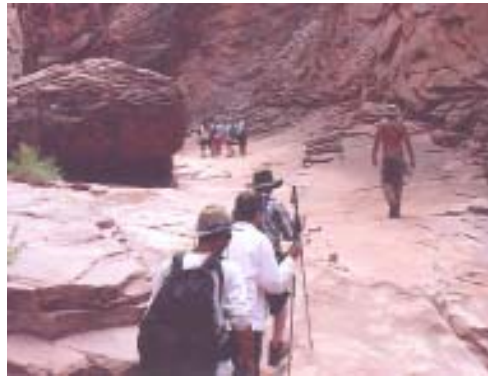
The group on one of many hiking trips.