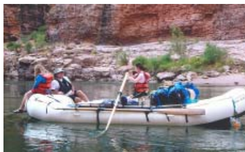
They rafted to settings not accessible by car or on foot.