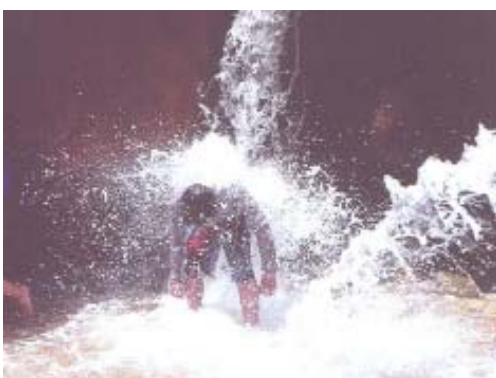
Showering under a waterfall.

that holds this energetic eighth-grader back – she helps her mother make decorative tiles, takes tae kwon do, enjoys reading, works in her school's media center and has been accepted into the International Baccalaureate program at Hillsborough High School.