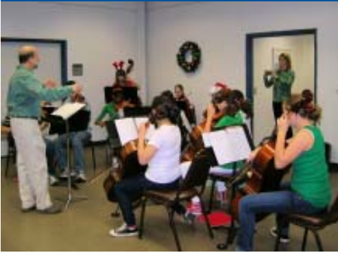
Coleman Middle School's orchestra returned for its 10th consecutive year!

Our holiday parties and graduation ceremonies took place on December 4 th and 11 th in Tampa and Winter Haven respectively. The highlight of these events was the recognition of our many 2009 graduates who completed programs enabling them to live independently, obtain employment, and or learn adaptive computer skills. All of our graduates worked very hard and, in many cases, exceeded their expectations in developing the skills needed to achieve their goals.